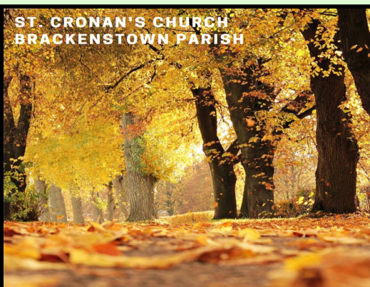
ST. CRONAN'S CHURCH BRACKENSTOWN PARISH

The Irish Bishops Conference has agreed for an Emergency Collection, 6th and 7th November, to take place in all Parishes including yours. Your Parish's Emergency Collection will support Trócaire's work in the countries of East Africa and in nearby countries similarly affected, and rush urgent food, water, and lifesaving aid to people who desperately need your love now. Please help if you can. For more information see www.trocaire.org .