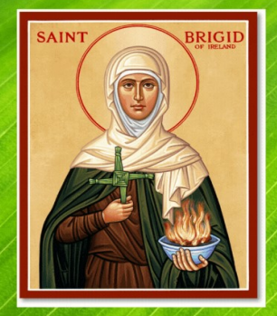
Wednesday 1st Feb 10:00 AM

A preparation Mass for Confirmation will take place this weekend, at 6.00pm on Saturday 28th & at 12.30pm & 5.00pm on Sunday 29th January