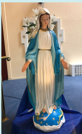
FEAST OF THE ASSUMPTION Blessed Virgin Mary

This Sunday members of our Parish Pastoral Council will present feedback from the questionnaires which parishioners filled out at Masses two weekends ago. Next weekend, Saturday/Sunday 16 th /17 th August, the PPC will give a brief presentation on the second Building Hope pillar: Building a community of Faith.